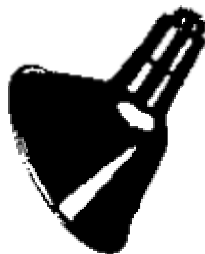
"RLM" sign lighting shield: